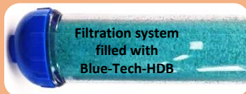
Filtration system filled with Blue-Tech-HDB

Fillers for face masks, filtration industry and sewage odors treatment