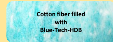
Cotton fiber filled with Blue-Tech-HDB

Fillers for hygiene products: baby and adult diapers, tampons, sanitary napkins